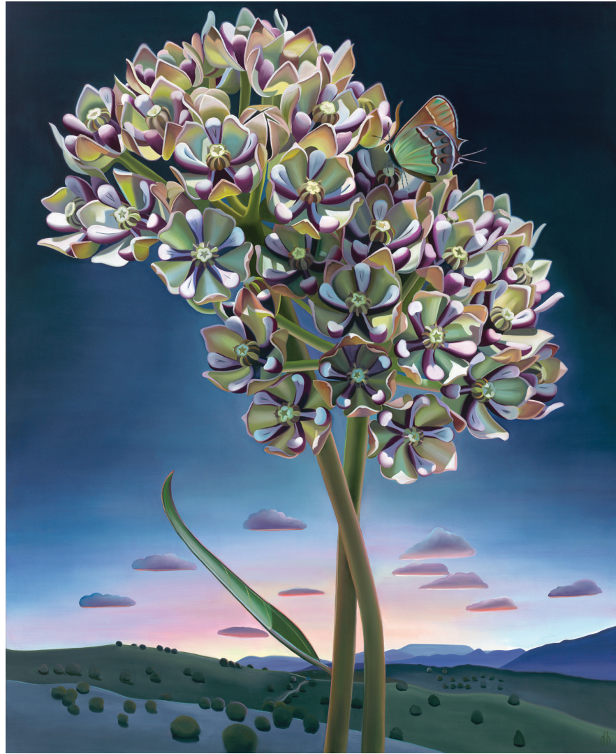
(Top left) A Thousand Words , oil, 50" by 40"

"These plants are Airbnbs for pollinators, but it's not a simple check-in. The unusual structure of the flower regulates pollination. Insects snag sacs of pollen on their legs, but then they must be perfectly inserted in the slits behind the crown. If the pollen is inserted backwards, the grains germinate in the wrong direction and are wasted. This is why there are so few pods produced per plant. For butterflies, it's a survival game too; their species only lays eggs in milkweed, thus their declining numbers. On this day, the juniper hairstreak butterfly was diligently pollinating. As I watched him work, it felt like I was witnessing a miracle. It's moments like these that fuel the work of my hands."