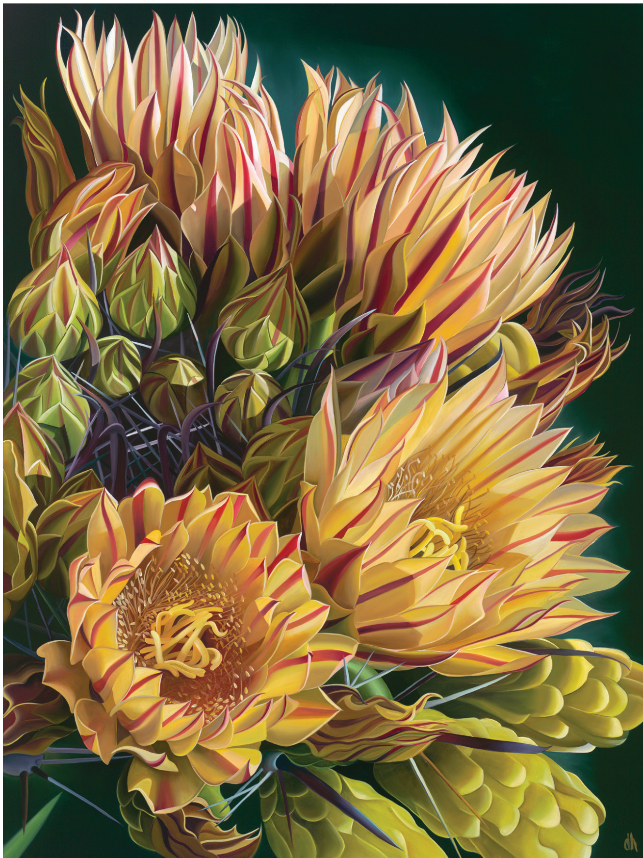
I Love Flowers. Don't You?, oil, 48" by 36"

"Even if monsoon season was a bust, you can count on barrel cactuses to bloom in sheer reds and pale yellows (and, in this case, golds) at the end of an Arizona summer. Barrel cactuses sit like little Buddhas in the Southwest landscape, often overlooked and overshadowed by the larger, more prestigious, columnar saguaro, unless they are in bloom. On this day, I was in the right place at the right time. I saw the gold glow in the distance and spun the Jeep around, because that's what you do when you love wild plants and places."