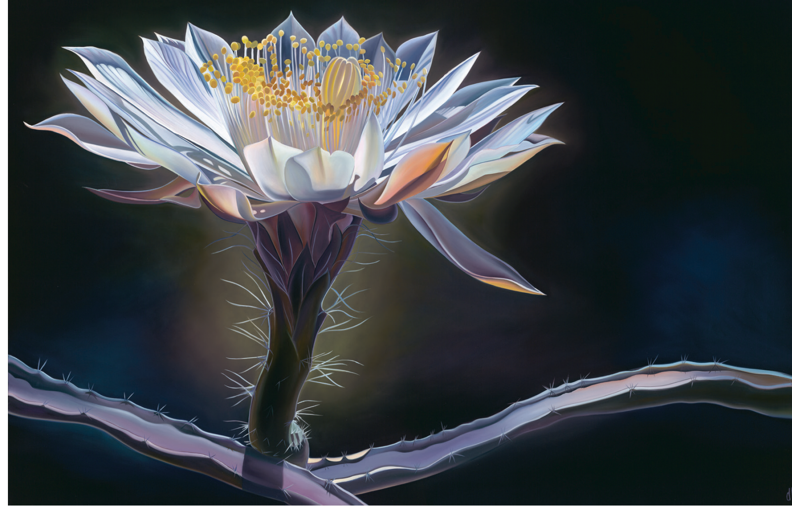
Royal Flush, oil, 40" by 60"

"Even if monsoon season was a bust, you can count on barrel cactuses to bloom in sheer reds and pale yellows (and, in this case, golds) at the end of an Arizona summer. Barrel cactuses sit like little Buddhas in the Southwest landscape, often overlooked and overshadowed by the larger, more prestigious, columnar saguaro, unless they are in bloom. On this day, I was in the right place at the right time. I saw the gold glow in the distance and spun the Jeep around, because that's what you do when you love wild plants and places."