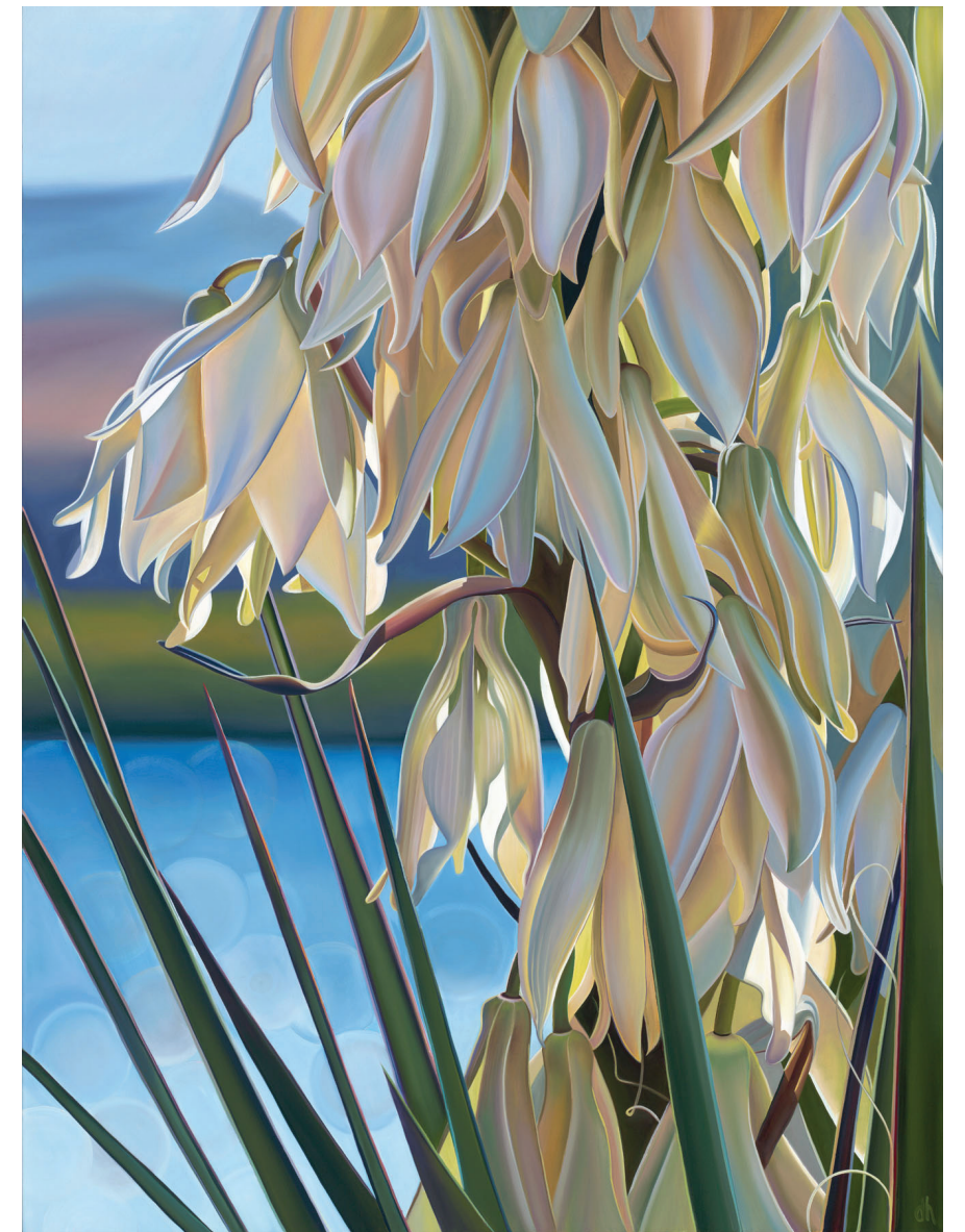
Shimmering Light, oil, 48" by 36"