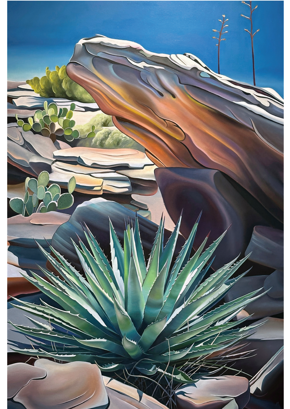
Shelter , oil, 40" by 60"

Hesson was back in the light and the diverse landscapes and plants she loved—and she thrived. Armed with a camera, she heads out in her Jeep to explore the countryside. "I'm always looking for the next painting and discovering what feeds my creativity," she says. "I ac-